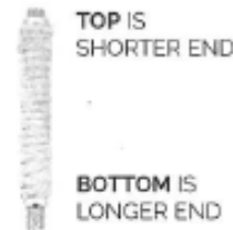
C. Pull Up Rod