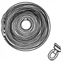
A. Mounting Canopy and Chain