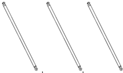
C. Arms (x3)